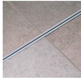
↑ Single rebated track set directly into tiling.

Draks uses a bottom-weighted track system, which rebates a spring-loaded wheel to the underside of the door, offering great practical advantages. It means the wider the door, the greater the stability (the converse of most top weighted systems). The top track acts as a guide only, thus allowing installation in places with problematic ceiling construction. The bottom track may be surface mounted and, being only 6mm does not cause an obstruction. It may also be recessed into carpet, laminate, hardwood floors or even marble and tiling. The top and bottom tracks are either single, double or triple.