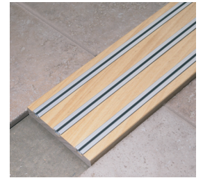
↑ Triple rebated track set into timber.